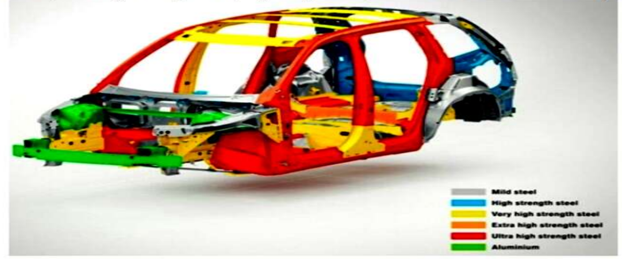
Figure 3. The materials used in new XC90

: aluminum, HSS: high strength steel, Mg: magnesium, CFRP: carbon fiber reinforced polyn